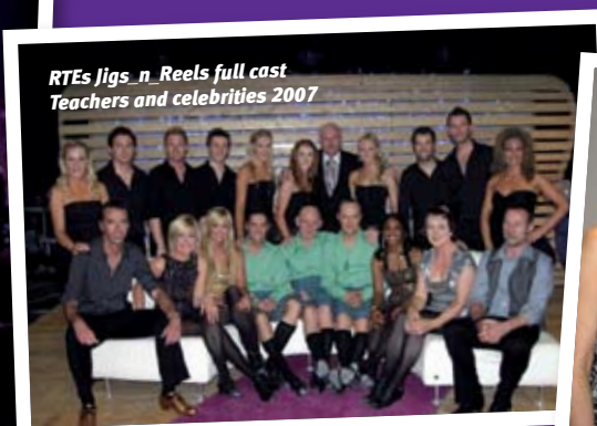
RTEs Jigs n Reels full cast Teachers and celebrities 2007